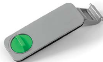
Battery Door Assembly (includes 03-818) Part # 03-815