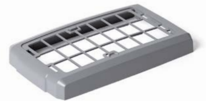
HEPA Cartridge/Filter Door Part # 03-813