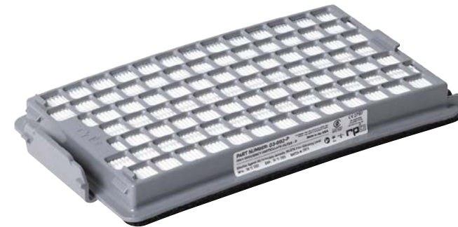
HEPA Cartridge/Filter Part # 03-892