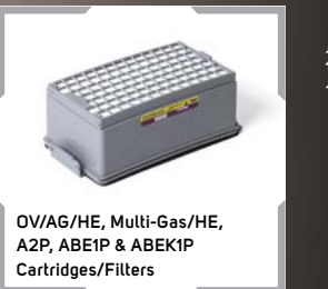
OV/AG/HE, Multi-Gas/HE, A2P, ABE1P & ABEK1P Cartridges/Filters

HEPA cartridge/filter - removes up to 99.97% of particulates down to 0.12 microns. Gas cartridges/filters protects against organic vapor exposure. Replace the pre-filter daily to extend the life of the main cartridge/filter.