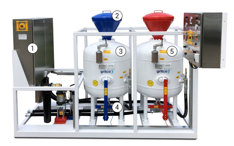
Special series for (up to) 300 meters working depth. Actual configuration customized to required blasting depth, number of user, skid options, et cetera