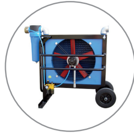
COMPRESSED AIR AFTERCOOLERS