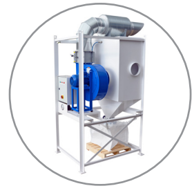
MOBILE DUST EXTRACTION UNITS