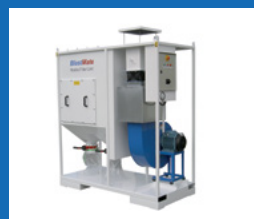
Mobile dust extraction units