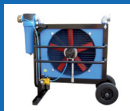
Compressed air aftercoolers