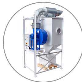
MOBILE DUST EXTRACTION UNITS